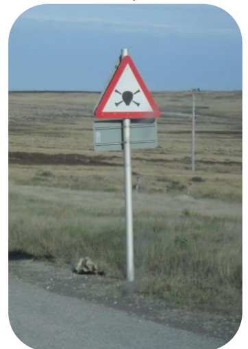
One of the many still active minefields, Falkland Islands, 2010. This seems a fitting metaphor for the Call Process!

So, may God's every blessing be upon us all on the journey we make together.